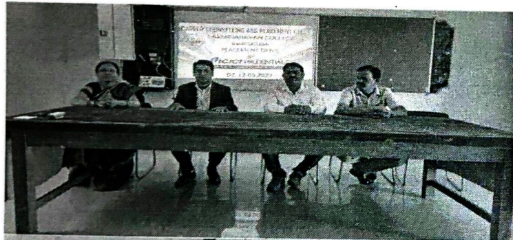
CAREER COUNSELLING AND PLACEMENT DRIVE BY ICICI PRUDENTIAL ON DT,12.03.2022