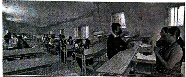
PLACEMENT DRIVE BY HYUNDAI JHARSUGUDA ON DT. 12.02.2022