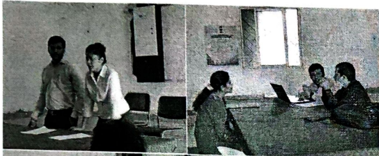
PLACEMENT DRIVE BY TPOWDL ON DT.27.11.2021